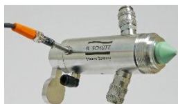
Option Sensor AE00.1650E