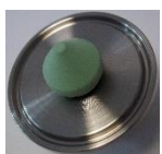
.4 Tri-Clamp 1 ½"