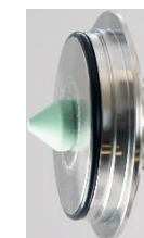
.1 Varivent-Cover Type N