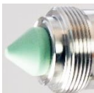
.3 Inlet-thread Bio-Con